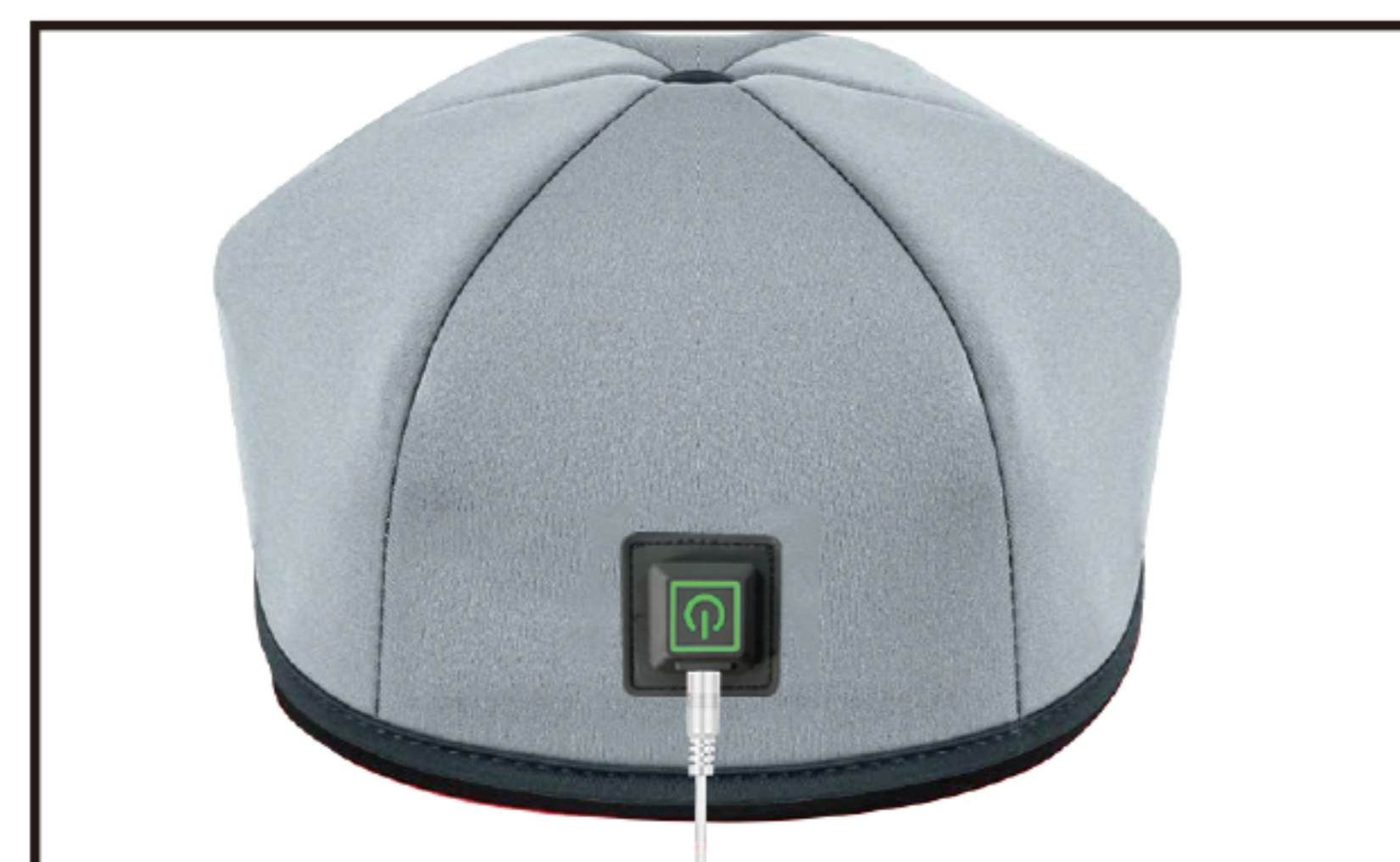
3 . Press the switch to turn it on or off