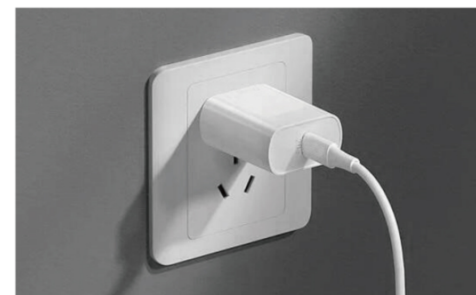
2 . Plug in the power cord ( plug not included )