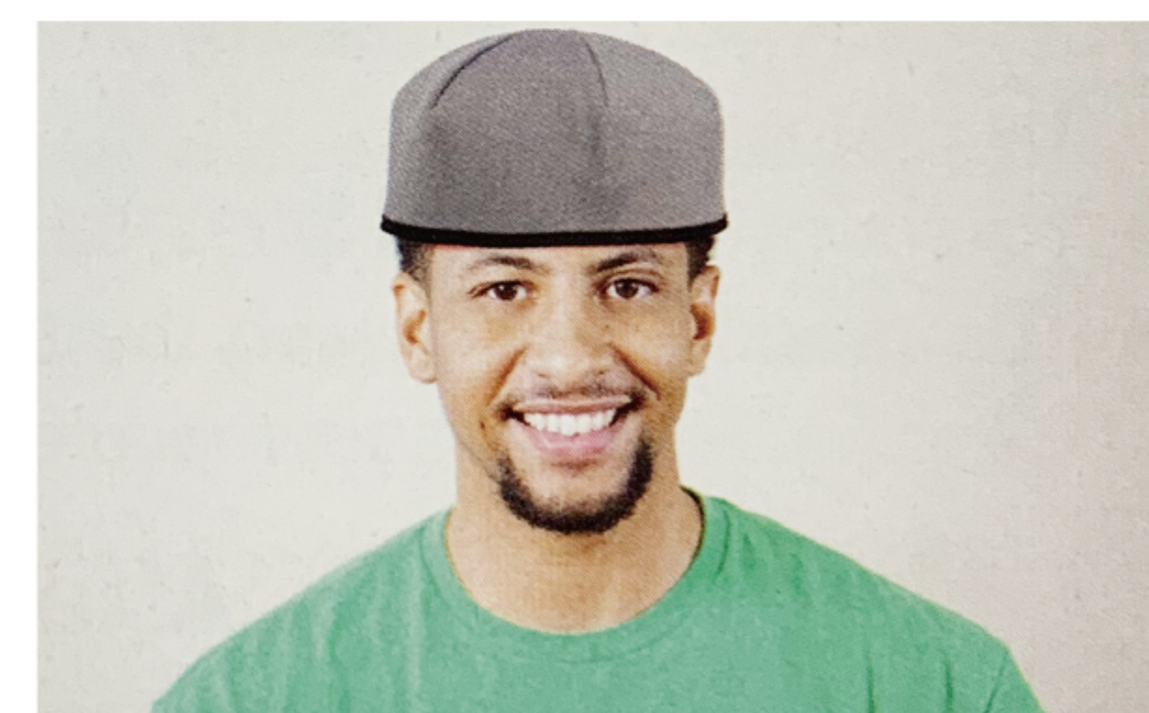
4 . Put the hat on the head