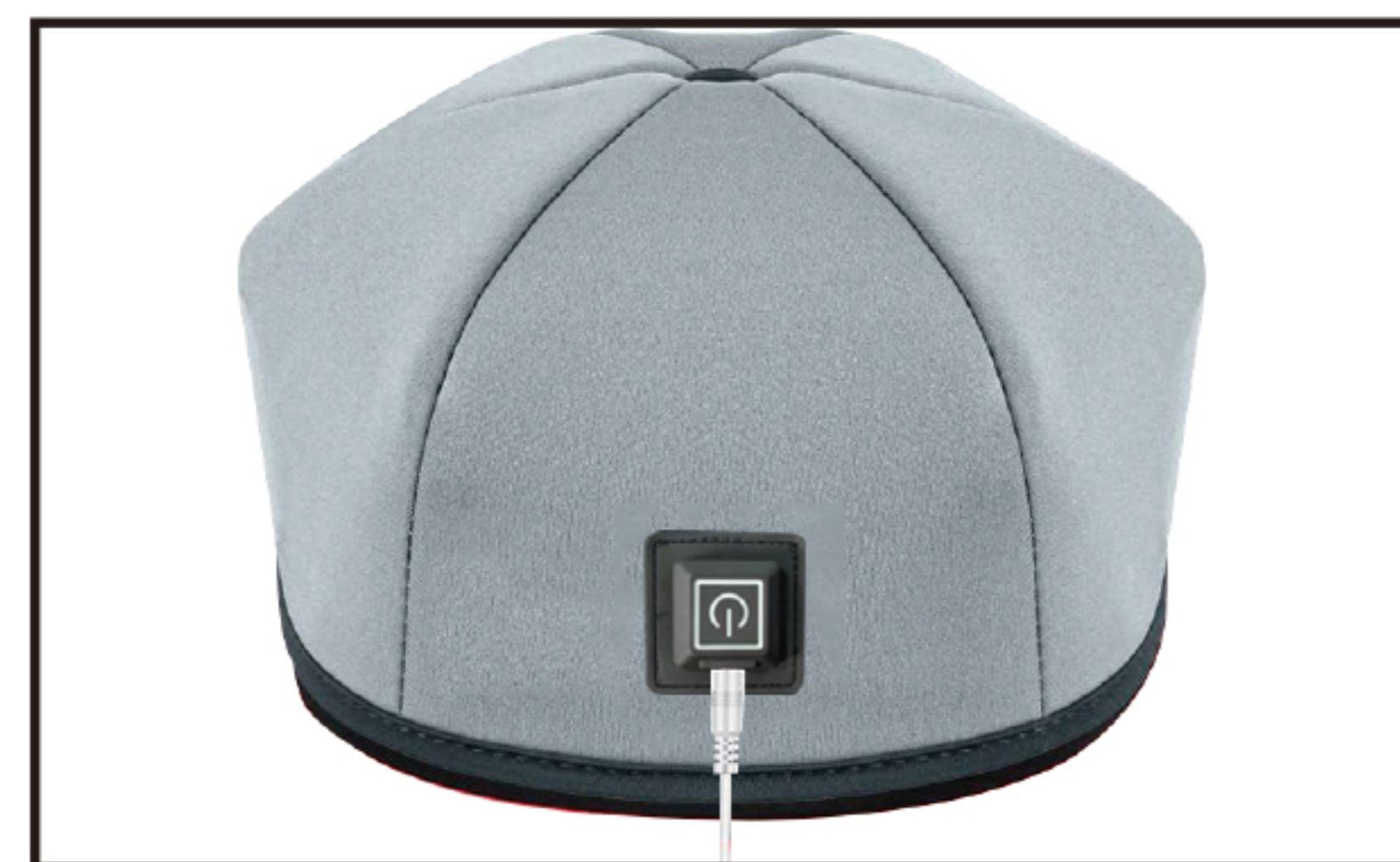
1 . Product connect to the controller.